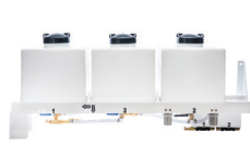
2 Admix System