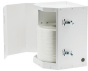
Fiber Dispenser System