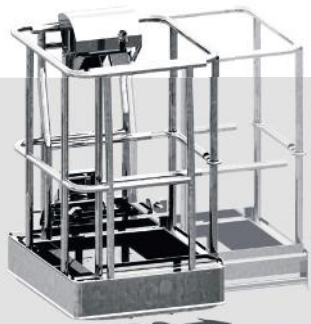
TASKET RESIZABLE BASKET DISMOUNTING NOT REQUIRED

A resizable basket that allows the operator to manually extend the basket sideways.